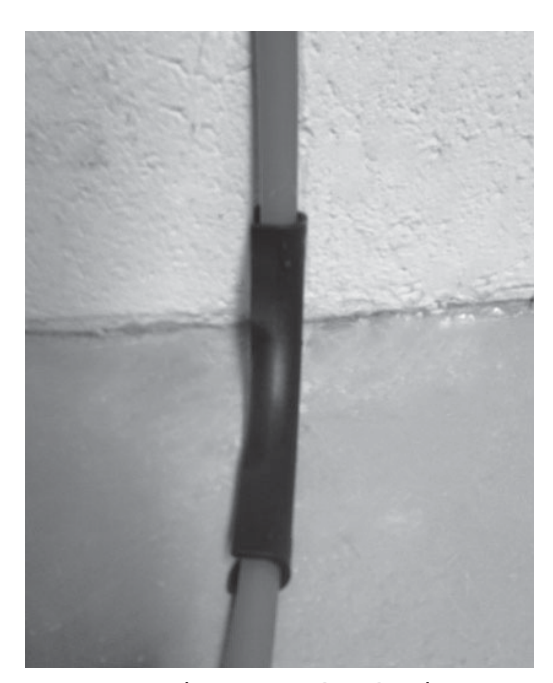
Use the Warmup Pipe Bend Support where it enters the floor.

To install PVC Bend Guides, simply insert the WARMUP pipe through the PVC Bend Guide to the appropriate length, (50-75 cm). The PVC Bend Guide should be positioned so that the pipe rises straight to the manifold with approximately half the guide within the floor.