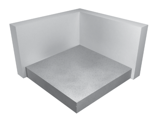
Prepare the subfloor