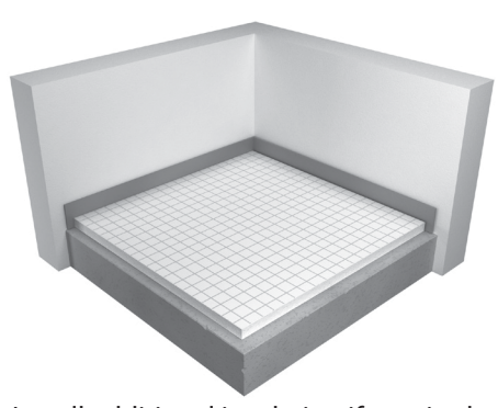
Install additional insulation if required