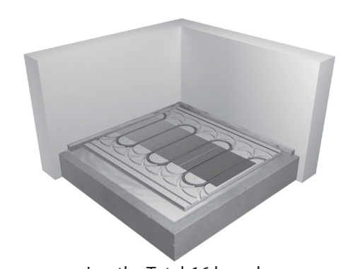
Lay the Total-16 boards