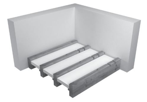
Fit insulation between the joists

Use 25mm to 50mm screed to cover the pipe. Lay final floor covering once screed has cured and has been commissioned as per manufacturers instructions.