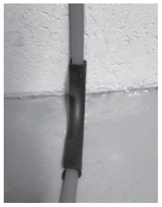
Use the Warmup Pipe Bend Support where it enters the floor.

When installing the conduit cut along the length of the conduit and clip onto pipe.