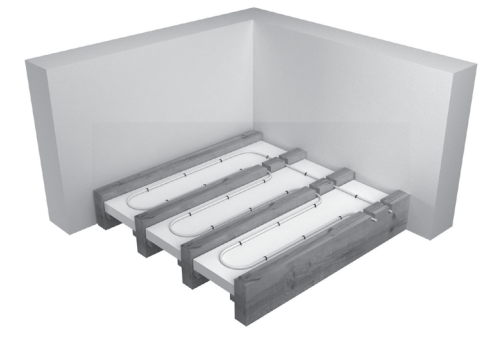
Run the pipework to the designed pattern