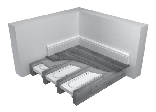
Lay final floor covering once screed has cured