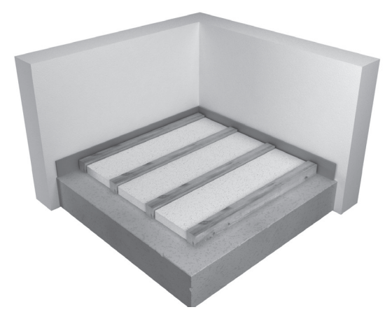
Fit insulation between the joists

Lay final floor covering 90° to the plates.