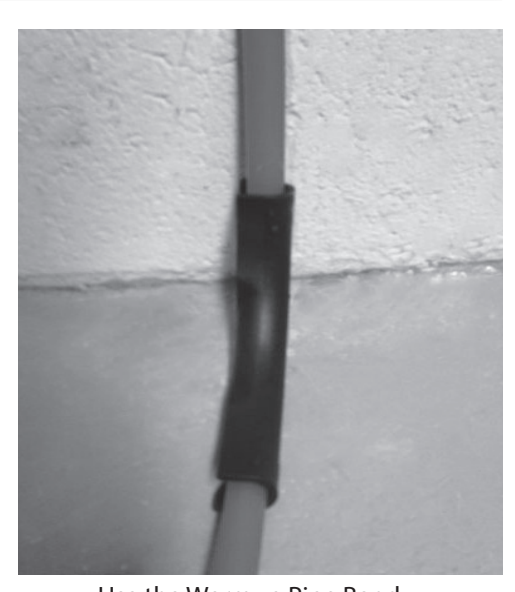
Use the Warmup Pipe Bend Support where it enters the floor.

When installing the conduit cut along the length of the conduit and clip onto pipe.