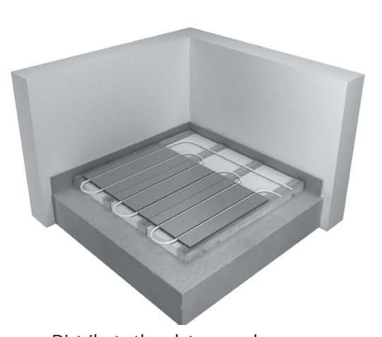
Distribute the plates evenly across the floor.